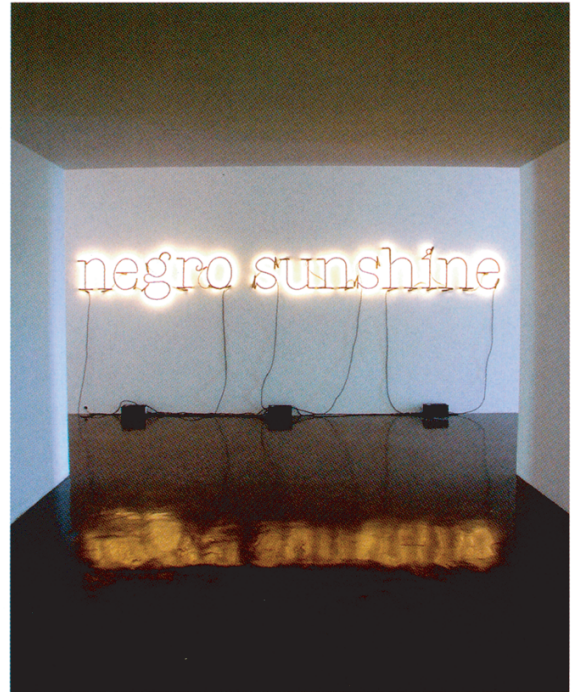
Glenn Ligon, Warm Broad Glow , 2005, neon, paint. Installation view, Renaissance Society, Chicago, 2008.

A much-needed map of this uncertain terrain was on view this past summer right in Obama's backyard. Borrowing its title from the famous sermon in the prologue to Ralph Ellison's 1952 novel, Invisible Man , the exhibition "Black Is, Black Ain't"—elegantly mounted