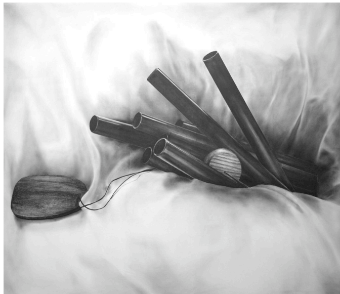
Brent Steen, Centerpiece (the lowering) , 2009; pencil on gessoed panel, 36 x 42 inches

Opening Reception Friday June 19 6 – 8pm