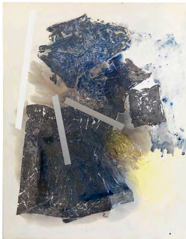
Sigrid Sandström, Untitled , 2015 Acrylic on polyester canvas, 76 x 60 inches

Gallery hours: Wed. – Sat., 11 – 6 and by appointment